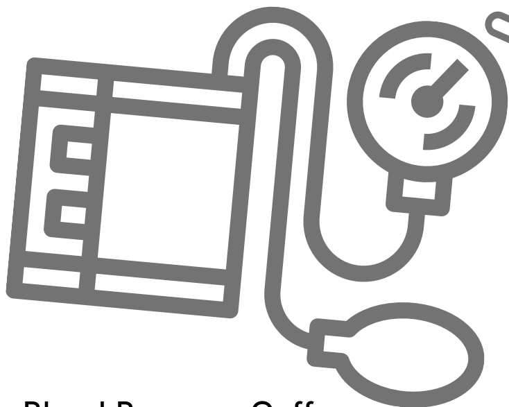
Blood Pressure Cuff

Color some of the tools that a nurse uses everyday!